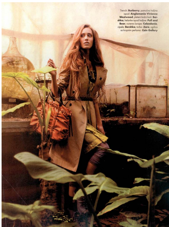
Trench: Burberry; pamučna haljina: Westwood; plišani kožni kosi: Bershka; haljina: spod haljine: Pull and Bear; vunene čarape: Calzedonia; cipele: Bershka; torba: Zara; ogledalo sa krpom: parfumi: Cain Gallery