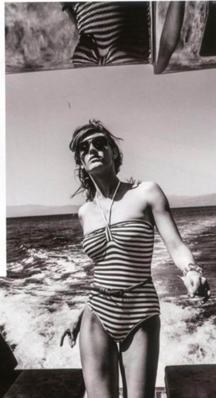
Tweed hat Chanel (Linea Piu), silk top Max Mara (Max Mara Boutique). Swimwear (Vogue Boutique), leather belt Max Mara (Max Mara Boutique), sunglasses Tom Ford, silver bracelet G-list. Jersey sleeveless jacket and silk shorts, both One on One (Zilly), bracelet Hermès (Hermès Boutique), python sandals Jimmy Choo (Kalogirou), beach bag (Vogue Boutique).