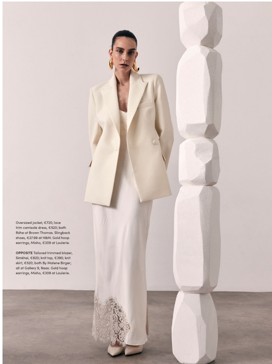
Oversized jacket, €720; lace trim camisole dress, €520; both Balne of Brown Thomas; Stiegelmack shoes, €27.99 at H&M; Gold hoop earrings, Misha, €309 at Loulane. OPPOSITE Tailored trimmed blazer, Simiani, €320; knit top, €290; knit skirt, €520; both By Malene Birger; all at Gallery 9, Naam; Gold hoop earrings, Misha, €309 at Loulane.