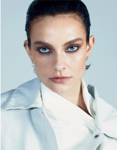
SHIRT: USSEY NYNAXE; JACKET: MARION MARGIELA; LARRINGS: THEODOSIOTS; HIPPOLITICA