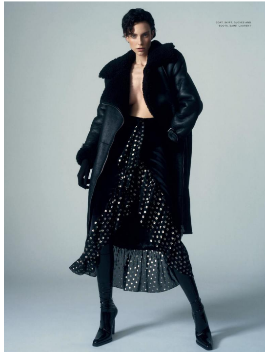
COAT: WOLF; GLOVES AND BOOTS: SAINT LAURENT