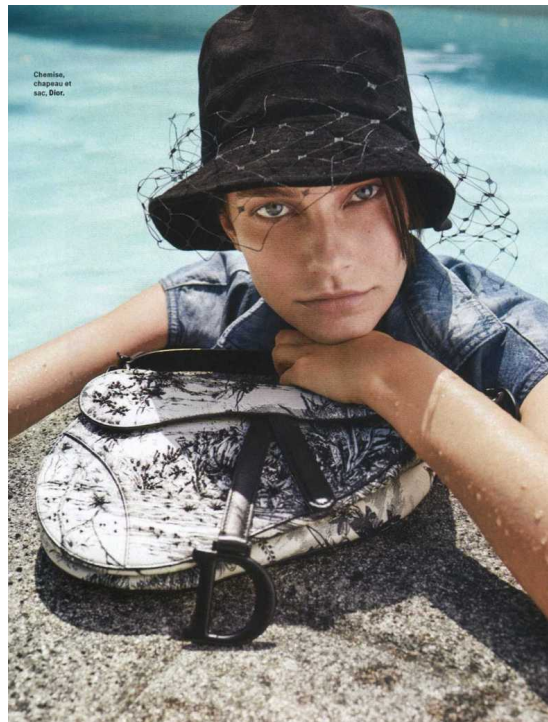
Chemise, chapeau et sac, Dior.