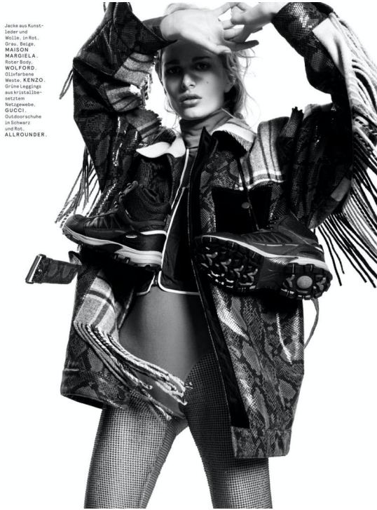
Jacke aus Kunstleder und Wolle. In Rot, Grau, Beige. MAISON MARGIELA. Roter Body. WOLFFORD. Glitzerbreme. Weste. KENZO. Striped leggings aus kristallidesequiem Netzgewebe. GUCCI. Outdoorstiefele in Schwarz und Rot. ALLROUNDER.