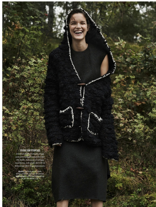
ŠERSTANI ŠUM VETERINAR A model iz šersti iz kraljeve prirode svojim vjetrovima i komadima koji su čvrsti, odabiraju se za prirode moj dom, koji nije dalek od klimatskog odabira i prirode.