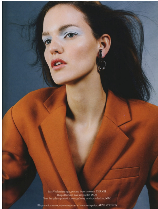
Baza Vitalumiere aqua, ruzina Joues contraste, CHANEL Pudra Diorskin made air powder, DIOR Tema Pro palette paleta, pomada Satry movie powder kiss, MAC Šerstveni pidžaka, serija-podvjeska iz tamnoga srebra, ACNE STUDIOS