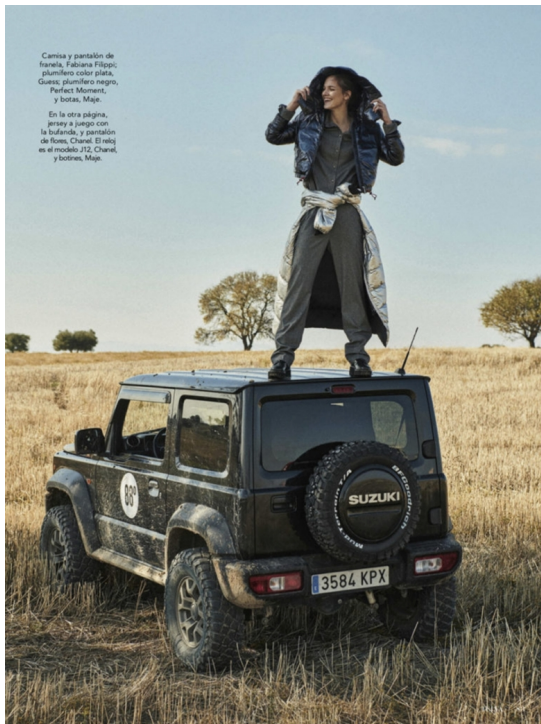
Camisa y pantalón de fiavella, falbana Filippi, plumero color plata, Gucci, plumero negro, Perfect Moment, y botas, Maje. En la otra página, jersey a juego con la bufanda, y pantalón de flores, Chanel. El resto es el modelo J12, Chanel, y botines, Maje.