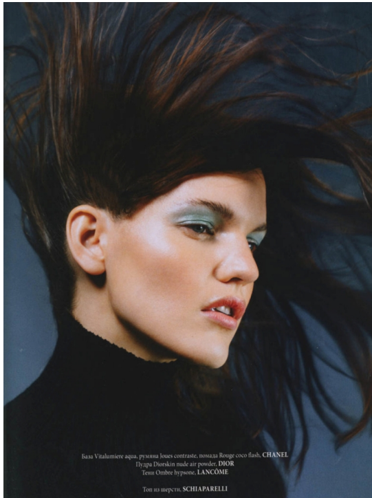
Baza Vitalumiere aqua, ruzina Joues contraste, pomada Rouge coco flash, CHANEL Pudra Diorskin made air powder, DIOR Tema Ombre lipson, L'ANCIOME Ton iz šersti, SCHIAPARELLI